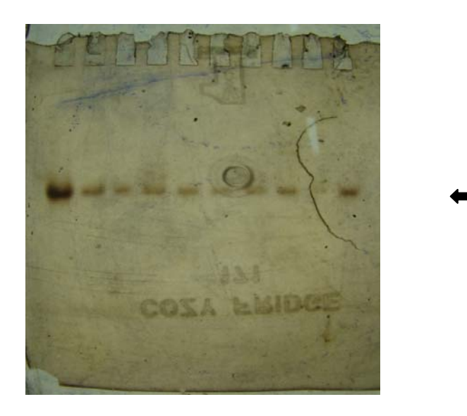
Fig. 2. The control (normal) sample in the first lane showing sharp and prominent band for Hp2-2 as compared to the samples of cases loaded in rest of the lanes.